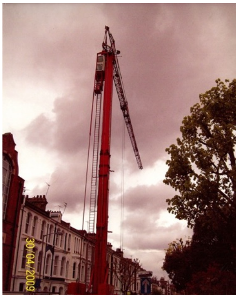
Construction work for the roof in April 2009 Now the 10-year anniversary