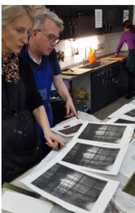
Photo etchings can be combined with many print techniques, including Chine Collé and a la poupée . The image will have a more inky, painterly feel than a printed photograph. Either way, the result often has a more 'artistic' effect than digital printing, printed onto high quality art paper with an emboss around the image and rich colours created by using etching inks.

Photo etching allows you to transfer a photograph (or drawing) onto an etching plate which can then be printed many times in different colours with etching inks. This photographic element is not possible using normal etching techniques (such as hard or soft ground etching).