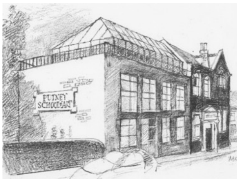
Drawing by Margaret Knott illustrating the proposal for the roof extension

The Friends have purposefully organised to enhance the scope and activities of the School, by raising funds and developing activities that have expanded the School and helped to raise its profile in the local community.